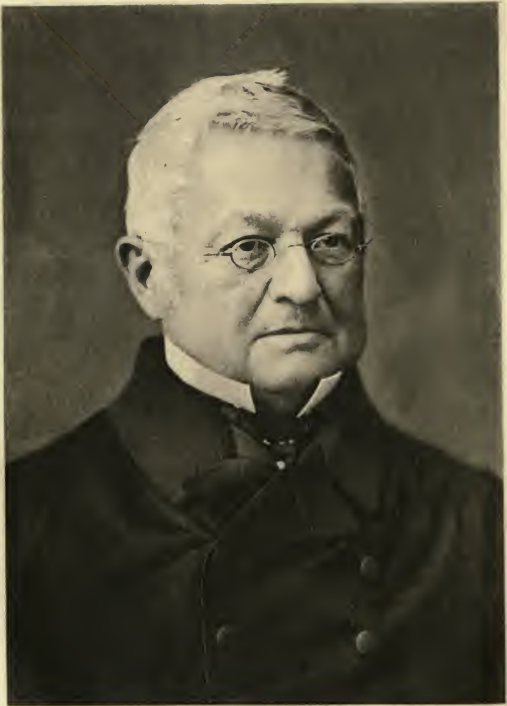
Adolphe Thiers. First President of the Third Republic.